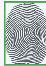
MSO 1300 Series Capture