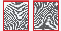
Placement variations on smaller sensors

MSO 1300 Series capture surface (14x22mm) ensures that the richest area on fingerprints is systematically captured time after time. Acquisition surface area contributes significantly to the overall biometric performance: