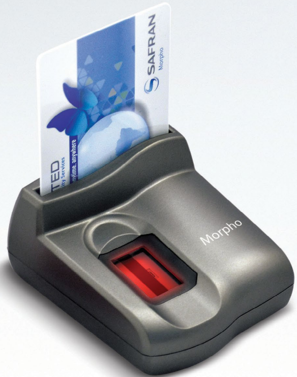
MSO 1350 V3 / MSO 1350 E3