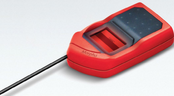
MSO 1300 V3 / MSO 1300 E3

The MorphoSmart™ 1300 Series offers a reliable, ergonomic and cost-effective solution for enrollment, identity verification and user identification. Their match-on-device or match-on-card functions guarantee the faultless protection of information and the security of desktop applications.