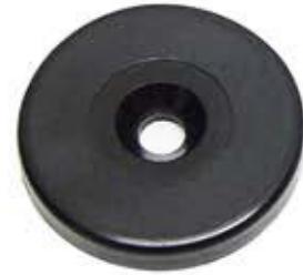
Check Point Tags